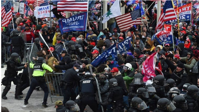
Capitol riot January 6, 2021

“Lost, Not Stolen” is the title of a newly published report by politically conservative judges, senators, and others who carefully investigated the charge made by Donald Trump that the 2020 election was stolen by corruption. This is the charge that riled up Trump fans to assault law enforcement personnel in Washington D.C. and to breach the Capitol building on January 6, 2021. The authors of “Lost, Not Stolen” are “political conservatives who have spent most of our adult lives working to support the Constitution and the conservative principles upon which it is based: limited government, liberty, equality of opportunity, freedom of religion, a strong national defense, and the rule of law.” After examining “every claim of fraud and miscount put forward by former President Trump and his advocates,” they present their findings in this report. It is available for anyone to examine. Their conclusion is as follows: “Joe Biden was the choice of a majority of the Electors, who themselves were the choice of the majority of voters in their states. Biden’s victory is easily explained by a political landscape that was much different in 2020 than it was when President Trump narrowly won the