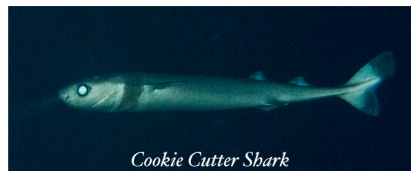
Cookie Cutter Shark