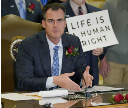
Oklahoma Governor Kevin Stitt

The following is excerpted from “Life Begins at Conception,” Christian Headlines , May 26, 2022: “Oklahoma Governor Kevin Stitt signed the nation’s strictest abortion ban into law on Wednesday, banning the procedure from the moment of conception. House Bill 4327 went into effect immediately after Stitt signed it on Wednesday. It is considered the strictest abortion law in the nation because it restricts physicians from performing abortions at any point in the pregnancy except for cases of rape, incest or a medical emergency. ‘I promised Oklahomans that as governor, I would sign every piece of pro-life legislation that came across my desk, and I am proud to keep that promise today. From the moment life begins at conception is when we have a responsibility as human beings to do everything we can to protect that baby’s life and the life of the mother,’ Stitt said in a statement. ‘That is what I believe, and that is what the majority of Oklahomans believe. If other states want to pass different laws, that is their right, but in Oklahoma, we will always stand up for life.’ The new law also allows citizens to file civil lawsuits for up to $10,000 against anyone who performs an abortion or assists a woman in obtaining one.”