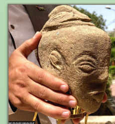
The statue of Anat is now on display in one of the Gaza Strip's few museums

A Palestinian farmer in southern Gaza recently discovered the head of a statue of Anat, a Canaanite goddess. The head is 8.6 inches high and is crowned with a serpent ( Ancient Origins , Apr. 26, 2022). A sister of Baal, Anat was one of the fertility mother-goddesses that were worshipped by orgies. She was also the goddess of war against Baal's enemies. "Anat appears as a fierce, wild and furious warrior in a battle, wading knee-deep in blood, striking off heads, cutting off hands, binding the heads to her torso and the hands in her sash" ( Wikipedia ). Anat was worshipped in various places under manifold names and myths, including Inanna, Ishtar, Aphrodite, Isis, Venus, Nerthus, and Freyja.