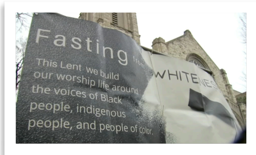
First United Church of Oak Park is standing by its decision to "fast from whiteness" for Lent, despite a significant backlash.