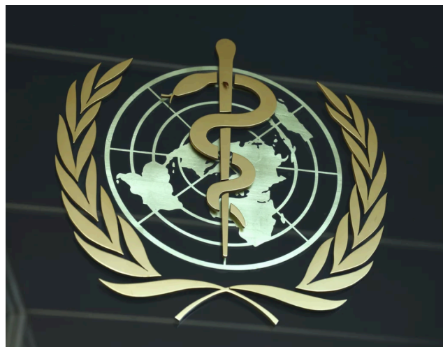
WHO headquarters in Geneva, Switzerland.