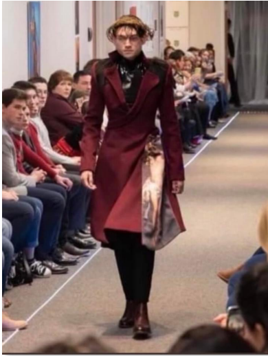
BjU Fashion Show 2021