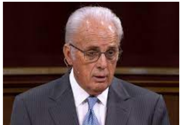
Pastor John MacArthur

The following is excerpted from “Thousands of churches raise alarm,” Fox News , Jan. 17, 2022: “Thousands of clergy in North America devoted their sermons on Sunday to affirming biblical sexual morality in response to a new Canadian law some warn could effectively criminalize such teachings. An initiative begun by Liberty Coalition Canada and promulgated in the United States by Pastor John MacArthur of Los Angeles secured the support of more than 4,000 Christian pastors who publicly expressed their willingness to protest from the pulpit