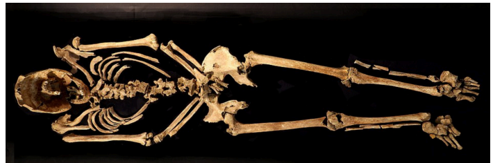
Remains of a Roman slave (pictured) with a two-inch iron nail driven through his heel bone have been found in Cambridgeshire — and are the 'world's best example of crucifixion'