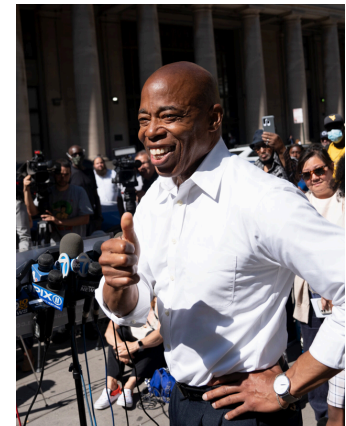
New York City Mayor-Elect Eric Adams

were discarded during the de Blasio years. ... ‘We’re not going to have a city where anarchists come from outside our city and go into a community such as Queens and destroy the community for their own selfish needs and desires,’ Adams said. Adams ran as a Democrat in the overwhelmingly blue [Democrat] city, but his Thursday comments seemed well-received by some notable local Republicans in the audience.” [Note: Such comments would be well-received by anyone who loves law and order, politics notwithstanding.]