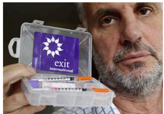
Philip Nitschke poses with his ‘suicide kit’