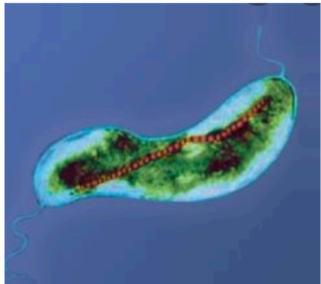
Example of a magnetotactic bacterium containing a chain of magnetosomes

temperatures and other conditions that would kill anything alive. These amazing abilities were not designed and built by mutations and accidents. They show that our Creator provides for the needs of all His creatures--even bacteria--and that He does so with unlimited creativity. Author: Paul A. Bartz. Ref: 'Crystal growers seek bacterial know-how,' Science News , v. 138, 1990 p. 382."