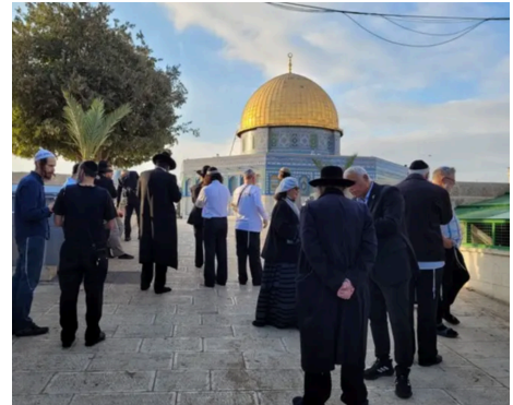
Jewish visitors on the Temple Mount on Wednesday.