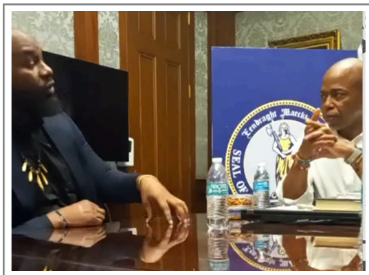
Hawk Newsome meets with Eric Adams

“The head of Black Lives Matter of Greater New York met with Eric Adams, the city’s mayor-elect, to discuss policing and warned that there will be ‘bloodshed’ if the city returns to its pre-De Blasio model, according to a report. Adams, himself a former police captain, on Wednesday