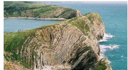
Lulworth Cove, Dorset, England