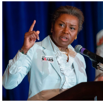
Lieutenant Governor Winsome Sears of Virginia, USA

in the state, for now. Facetiousness aside, the election of blacks, Asians, and Latinos are proof that America is a place of liberty and opportunity for all people, where immigrants of any skin color can succeed. After her win, Sears said, "We're framing too many issues in terms of race and it just continues to divide us. And, unfortunately, politicians are using it as a tool because of the things that have happened to us historically to advance, I would think, their nefarious purposes. I didn't do anything special to get here except stay in school and study. America allowed me to come and do for myself and for my family. No one can say to me I don't know what it is to be poor. You're looking at the American Dream. We're always going to have problems, I understand that. I'm not saying we're perfect. But you can see those people at the border right now trying to get in. They're dying to get in because they know if they can put a foot on American soil, the trajectory of their lives will change just as it did for my father" ("Winsome Sears reflects," Fox News , Nov. 4, 2021). She's right; the "people of color"