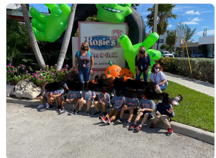
Here the kids pose outside the bar