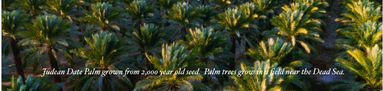
Judean Date Palm grown from 2,000 year old seed. Palm trees grow in a field near the Dead Sea.