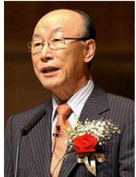
David Yonggi Cho

David Yonggi Cho, pastor emeritus of the Yoido Full Gospel Church of Seoul, died on September 14 at age 85. Cho, who was affiliated with the Assemblies of God, had a vast influence as the pastor of the church formerly billed as the world's largest. He claimed that he received the call to preach directly from Jesus, who supposedly appeared to him dressed like a fireman ("Paul Yonggi Cho," Dictionary of Pentecostal and Charismatic Movements ). He preached prosperity as part of a "five-fold gospel"--the gospel of regeneration, the gospel of the fullness of the Holy Spirit, the gospel of divine healing, the gospel of blessing, and the gospel of the advent. Cho invented the heretical "Law of Incubation." In his book The Fourth Dimension he described the steps of this "law"--first, make a clear-cut goal; second, create a precise mental picture of that goal; third, incubate it into reality by meditating on it; finally, speak it into existence. Cho admitted that he borrowed some of his teaching from Buddhist sects. In 2011, Cho was accused by 29 of the church's elders of embezzling US $20 million. In February