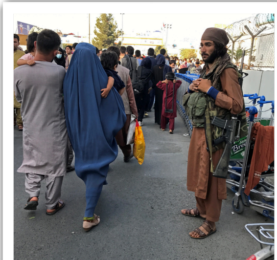
A member of Taliban stands guard as people walk at the entrance gate of Hamid Karzai International Airport in Kabul, Afghanistan, on August 16, 2021.