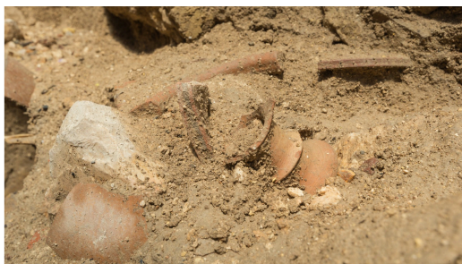
Remains of vessels shattered in an eighth century earthquake, uncovered in Jerusalem.

The following is excerpted from “Archaeologists Unearth,” The Times of Israel , Aug. 5, 2021: “[I]n the first verse of the Book of Amos, the 8th century BCE biblical prophet referred to ‘two years before the earthquake’ as an anchor to the events he was about to relate. Two centuries later, the prophet Zechariah again referred to this destructive earthquake period, so deeply was it ingrained in the collective psyche. Now, for the first time, a team of Israel Antiquities Authority archaeologists in Jerusalem’s City of David report that they have found unprecedented concrete evidence of this 8th century BCE earthquake in the ancient capital. In an upcoming research paper, the archaeologists chart, for example, that in one particular 8th century BCE structure the destruction layer did not show signs of fire, yet other factors suggested the building had been damaged in a traumatic event, apparently an