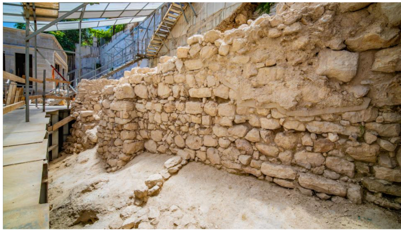
Remains of the city wall, City of David National Park.