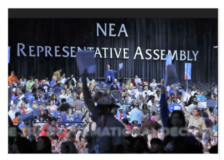
National Education Association Votes To Push "Critical Race Theory" Into K-12 Schools Across The Country

The following is excerpted from "Nation's Largest Teachers Union," The Daily Wire, July 5, 2021: "The nation's largest teacher union pledged to teach critical race theory--the ideology that claims America is irredeemably rooted in racism--in all 50 states and across the more than 14,000 school districts the union works with. ... In what the NEA claims to be the inclusion of 'accurate and honest teaching,' it vowed to 'oppose attempts to ban critical race theory' and the New York Times' '1619 Project,' which has been scrutinized by historians as ahistorical. Several states across the country are fighting back against critical race theory by banning educators from teaching it as fact in public school classrooms. Idaho was the first state to pass laws banning critical race theory, and other states such as Tennessee, Texas, Utah, Florida, and Iowa passed similar legislation. Despite the bans, thousands of teachers nationwide have pledged to continue teaching critical race theory." CONCLUDING COMMENT: The teacher's union quickly removed its pledge to teach critical race theory from their web site after the issue became national news, but this does not indicate a change of heart, just cowardly deception.