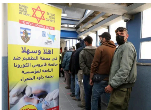
Israel lifts most COVID restrictions.

The following is excerpted from "Israel Lifts," CBN News , June 2, 2021: "Israel lifted nearly all of its COVID-19 restrictions on Tuesday as the daily infection rate remains at virtually zero. Now, Israelis will no longer need to use the proof of vaccination or recovery certificate known as the Green Pass to enter public venues like restaurants and gyms. The country also lifted restrictions on indoor and outdoor gatherings. 'Today is a very special day,' said Hezi Levi, Israel's Health Ministry Director-General. 'Now we are opening all the activity in Israel and no more green pass,' he added." Israel has also announced that the mask mandate will be lifted for indoor activities on June 15.