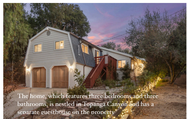
The home, which features three bedrooms and three bathrooms, is nestled in Topanga Canyon and has a separate guesthouse on the property.