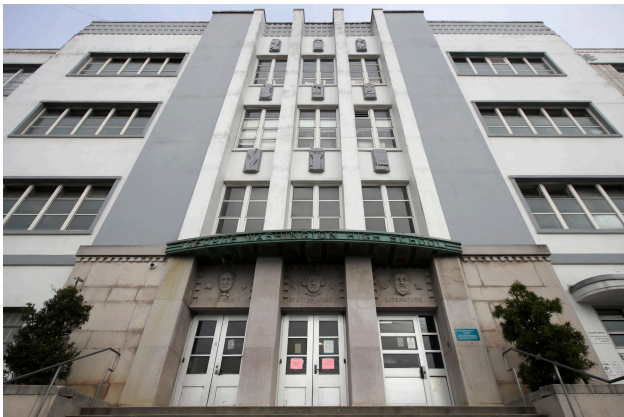
George Washington High School is one of the schools that the San Francisco Board of Education voted to rename, a move that has less to do with history than with celebrity.

We reported in October that 44 schools in the San Francisco School District were to be renamed, including those named after the nation's founding fathers. The list includes eight schools named after George Washington, Abraham Lincoln, Paul Revere, and Francis Scott Key (composer of "The Star Spangled Banner"). The name of any person who fails any one of the following criteria was to be removed: "Anyone directly involved in the colonization of people; slave owners or participants in enslavement; perpetrators of genocide or slavery; those who exploit workers/people;