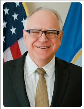
Gov. Tim Walz

The following is excerpted from “How the Left Is Stealing,” Powerlineblog.com, Jan. 27, 2021: “Across the country, leftists in charge of public education are substituting indoctrination for learning. Facts and objective standards are out, liberal shibboleths are the order of the day. My state, Minnesota, exemplifies the trend. Under state law, the Department of Education promulgates standards and benchmarks for K-12 schools in a variety of disciplines. These standards are periodically revised, and this year the Social Studies standards are being rewritten. Under Minnesota’s hard-left governor, Tim Walz, the committee doing the revision consists almost entirely of left-wingers. That committee has released the first draft of its standards. This draft drops almost everything normally regarded as history--the Revolutionary War, the Civil War, World War I, World War II, the Holocaust, and any reference to minor figures like George