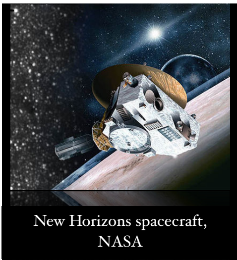
New Horizons spacecraft, NASA

Using technology from its New Horizons spacecraft, NASA now estimates that the number of galaxies is in the hundreds of billions rather than 2 trillion as previously thought. The New Horizons craft, launched in January 2006, captured the first close-up photos of Pluto and is now at the edge of the Milky Way galaxy, about 4.4 billion miles from Earth. The estimates are based on interpretations of “cosmic optical background” readings. The previous estimate was based on data collected by the Hubble Space Telescope. Scientists admit that they really don’t know how many galaxies there are or how vast the universe is. They are making guesses based on unproven presuppositions. The NASA website admits, “There may be many more faint, distant galaxies than theories suggest” (“New Horizons Spacecraft Answers Question,” Jan. 12, 2021, hubblesite.org ). Regardless if there are hundreds of billions of galaxies or 2 trillion or