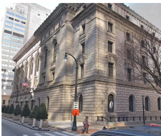
The U.S. 11th Circuit Court of Appeals in Atlanta