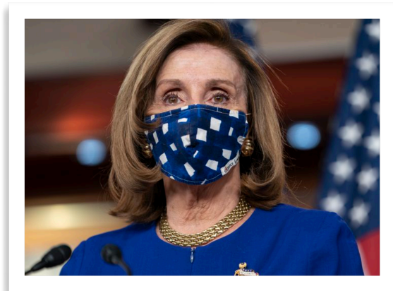
House Speaker Nancy Pelosi

In fulfillment of Bible prophecy, the Democratic leadership of the 117th U.S. House of Representatives is attempting to defy God with an “inclusive language” policy. The new rules would “address issues of inequities on the basis of race, color, ethnicity, religion, sex, sexual orientation, gender identity, disability, age, or national origin.” This is impossible nonsense, of course, since addressing alleged inequality on the basis of sexual orientation or gender identity creates inequality against sex and religion, etc. The rule would outlaw the use of he and she, father, mother, son, daughter, brother, sister, uncle, aunt, nephew, niece, husband, wife, father-in-law, mother-in-law, son-in-law, daughter-in-law, grandson, or granddaughter , among others. House Speaker Nancy Pelosi said the new measures would make the House of Representatives “the most inclusive in history.” True, and it would also make it the most stupid in history. “So God created man in his own image, in the image of God created he him; male and