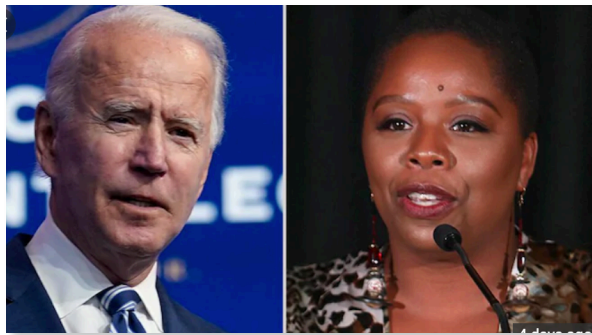
Joe Biden and Patrisse Cullors

The following is excerpted from “BLM Co-Founder Calls on Biden,” Townhall , Nov. 21, 2020: “Black Lives Matter co-founder Patrisse Cullors on Friday penned an OpEd in Teen Vogue calling for the next president to back the BREATHE Act, something she