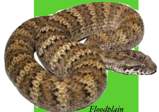
Floodplain Death Adder