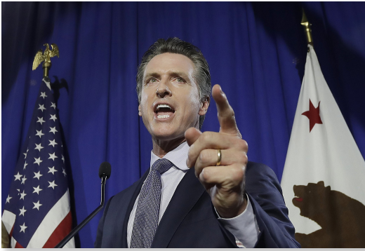
California Governor Gavin Newsom

If you want to know the future of America if Democrats are ever in full control, just take a look at California, where the Democrats control the governorship, both houses of the legislature, every statewide office, and the leadership of major cities. (When one party controls the office of governor, the state House, and the state Senate, that is called a trifecta. Currently, there are 21 Republican trifectas and 15 Democrat trifectas.) For example, their mindless commitment to Green Energy has resulted in third-world type brownouts across the state this summer. Their homosexual rights agenda has silenced free speech. Their clueless homeless policies have trashed formerly beautiful cities. Their public schools are removing the names of the nation's Founding Fathers and