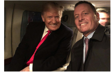
President Trump and Richard Grenell

The following is excerpted from “Grenell: ‘Trump Is Most Pro-Gay President,’” CNSNews.com, Aug. 21, 2020: “In a video distributed by the Log Cabin Republicans, former Acting Director of National Intelligence Richard Grenell states that Trump is the ‘most pro-gay president in American history.’ In a Twitter response to the video, Trump declared, ‘My great honor!!!’ Grenell, who is gay, served as the U.S. ambassador to Germany (2018-20) and as Acting Director of National Intelligence (2/20/20 - 5/26/20) under President Trump. Log Cabin Republicans ‘is the nation’s largest Republican organization dedicated to representing LGBT conservatives and allies,’ according to its website. In the video, Grenell, among other things, states, ‘I know firsthand that President Trump is the strongest ally that gay Americans have ever had in the White House. Donald Trump is the first president in American history to be pro-gay marriage from his first day in office.’”