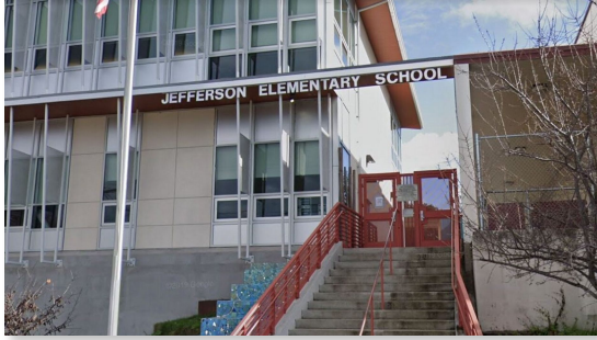
Two schools named after George Washington and Thomas Jefferson in the Berkeley Unified School District will be renamed after a push from Black Lives Matter activists.

The school board in Berkeley, California, has voted unanimously to rename elementary schools that bear the illustrious names of George Washington and Thomas Jefferson (“Two Berkeley Public Schools to be renamed in response to BLM movement,” San Francisco Chronicle , June 15, 2020). The shallow reason is that Washington and Jefferson “owned slaves.” This will do absolutely nothing to help black lives, of course. It is not surprising to see such insanity coming from Berkeley, which has been a leftist