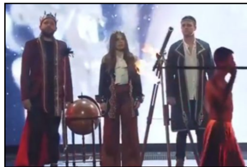
Hillsong Depicts Wise Man as a Woman

In a Christmas production (probably from 2019), Hillsong Australia depicted one of the wise men as a woman (“Hillsong Depicts,” Reformation Charlotte , May 9, 2020). This feminization of the wise men fits Hillsong’s passion to conform Christ to modern culture in direct disobedience to God’s Word, and Hillsong represents the heart and soul of contemporary worship music. It is a Christianity that is very much at home in this world. “And be not conformed to this world: but be ye transformed by the renewing of your mind, that ye may prove what is that good, and acceptable, and perfect, will of God” (Ro. 12:2). For more about Hillsong, see The Directory of Contemporary Worship Music , available as a free eBook from www.wayoflife.org .