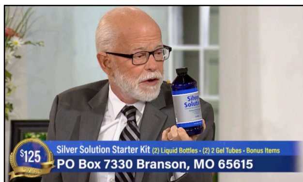
Jim Bakker advertising his bogus cure for Coronavirus.

body's tissues over months or years. Most commonly, this results in argyria (ahr-JIR-e-uh), a blue-gray discoloration of your skin, eyes, internal organs, nails and gums. While argyria doesn't usually pose a serious health problem, it can be a cosmetic concern because it doesn't go away when you stop taking silver products. Rarely, excessive