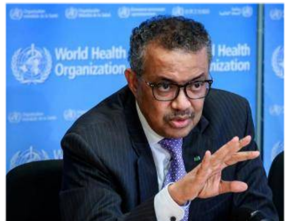
WHO Director-General Tedros Adhanom Ghebreyesus]