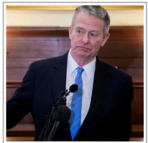
Gov. Brad Little