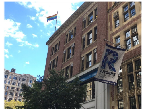
Rutgers Presbyterian Church in Manhattan.