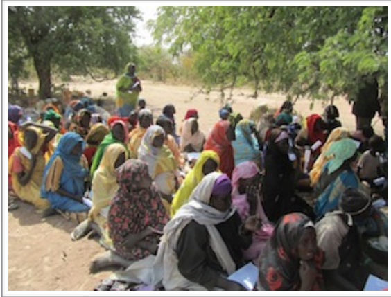
Freed Sudanese slave woman waiting for aid

The following is excerpted from “Black Slavery Exists Today” by Charles Jacobs, President of the American Anti-Slavery Group, The Stream , Sept. 4, 2019: “Today, an estimated 529,000 to 869,000 black men, women, and children are still slaves.