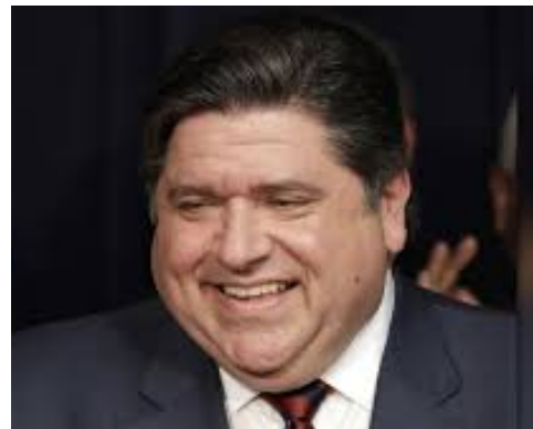
Gov. J.B. Pritzker