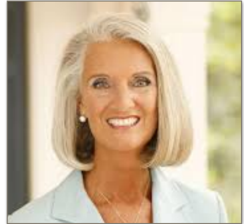
Ann Graham Lotz

A few years ago a preacher friend mentioned that he had been listening to some conservative evangelicals, including Anne Graham Lotz (not something I would advise), and he observed, “This Anne lady should have been a man. She makes some very good points, better than her dad Billy and her brother Franklin. She even talks about sin, repentance, hell, demons, earnest prayer, revival, about Israel in a favourable light, etc. There are a very small group of evangelicals that seem good on a few things.” I replied that for years I have noticed that Franklin Graham and Anne can talk a good talk, sounding stronger than their dad, but they walk in the same terribly disobedient footsteps. I have seen this same thing on the part of evangelicals that I have heard at various conferences and on visits to their churches. You sometimes find yourself thinking that you are listening to a true Biblicist who has a zeal for the truth, but then you