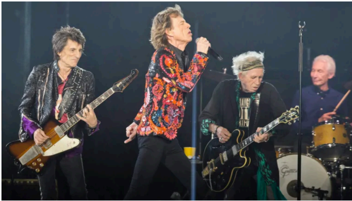
The Rolling Stones US No Filter Tour.

Four members of the original 1970s Rolling Stones rock band are still rocking well into their 70s (Ronnie Wood is 72, Mick Jagger and Keith Richards are 75, and Charlie Watts is 78), and they think that this is because “somebody up there likes us.” That is what Wood told the press recently, after lead singer Mick Jagger “bounced back” from a noninvasive heart valve replacement (“Rolling Stones’ Ronnie Wood reflects on sobriety, Mick Jagger’s ‘superhuman’ recovery,” The Sun , June 24, 2019). The band