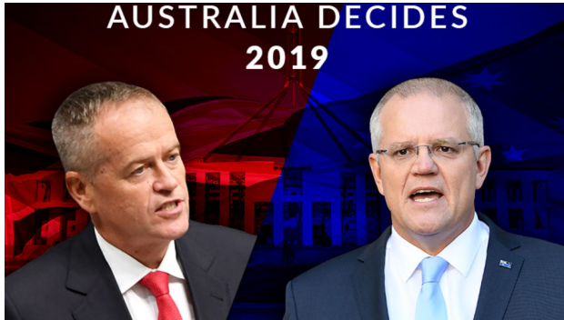
Bill Shorten and Scott Morrison

In an upset victory that surprised pollsters, Scott Morrison, Australia’s conservative prime minister, won the national election on May 18. The Labour Party, which was expected to win, has vowed to instigate a radical homosexual rights agenda and ban religious exemptions for those who oppose it. A friend in Australia wrote, “Final results are still to come to see if the Coalition (Liberals/Nationals) will be a majority Government, but at least Labour is not going to be running the show--not for a while