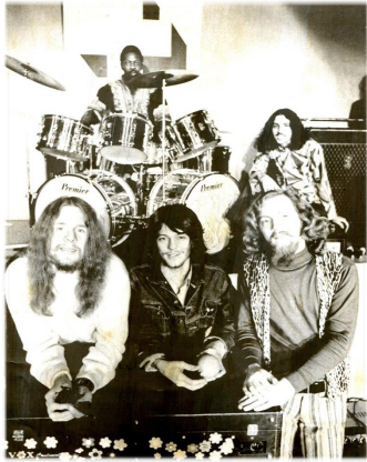
The Mind Garage

The first televised rock worship service, a half-century ago, had all of the earmarks of Contemporary Christian Music today and all of the loud warning signs for wise, Bible-believing Christians and churches. The date was April 27, 1969, the year I entered the U.S. Army. The band was The Mind Garage; the broadcaster was ABC (American Broadcasting Corporation); the forum was Saint Mark's Episcopal Church in Bowery, Manhattan. The event was called "14th Electric Mass." It was seen by thousands of people in the United States and rerun annually into the 1980s (classicchristianrockzine.com). Consider the earmarks of this proto-rock worship service: