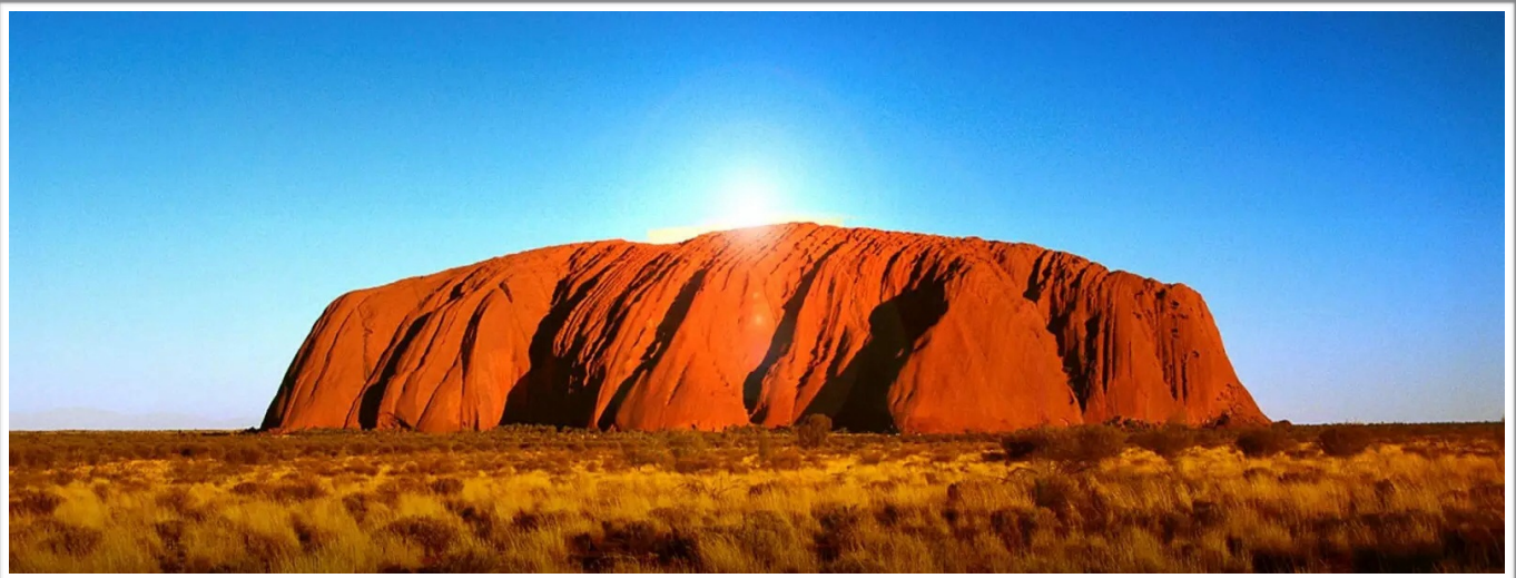
Uluru (Ayers Rock)

“Can God make a rock so big that He cannot lift” is a classical skeptical challenge. It is based on the following line of thinking: “The Christian God is omnipotent, which means he can do anything. But God cannot create a rock so big that he cannot move it, therefore the Christian God is not real.” The challenge is based on ignorance of the Bible’s teaching about God. The simple answer is that God cannot make a rock so big that He can’t move it because He is all-powerful (Job 42:2; Je. 32:17; Mt. 19:26; Lu. 1:37), and God would not make a rock that He can’t move because He is all-wise (Ps. 147:5; Isa. 40:28; 1 Jo. 3:20). There are, though, things that God cannot do. He cannot lie or repent of His spoken Word. “God is not a man, that he should lie; neither the son of man, that he should repent: hath he said, and shall he not do it ? or hath he spoken, and shall he not make it good?” (Nu. 23:19). This means that the following Word of God will prove to be true in the life of every skeptic: “He that believeth on the Son hath everlasting life: and he that believeth not the Son shall not see life; but the wrath of God abideth on him” (John 3:36).