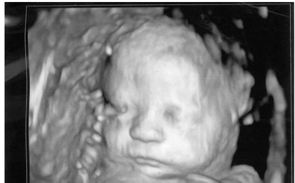
South Carolina Bill Would Ban Abortions After an Unborn Baby's Heartbeat Begins

regrets aborting her unborn baby. ... About 5,100 unborn babies were aborted in South Carolina in 2017, and most were later than six weeks of pregnancy, according to the state Department of Health and Environmental Control. Pro-life Gov. Henry McMaster, who also is in a legal battle to defund the abortion giant Planned Parenthood, said he would support the legislation."