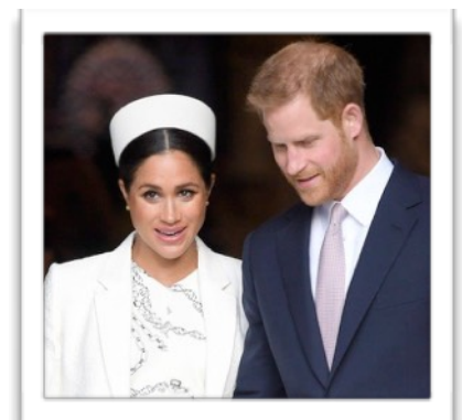
Meghan Markle & Prince Harry

The following is excerpted from “Meghan Markle and Prince Harry,” Yahoo.com/lifestyle , Mar. 1, 2019: “Despite reports surfacing that Meghan Markle and Prince Harry have learned they are having a boy, the royal pair don’t plan to let that change how they will raise their child. A source recently revealed to Vanity Fair , that Meghan has expressed wanting to raise her baby without gender stereotypes. ‘Meghan has been talking to some of her friends about the birth and how she and Harry plan to raise their baby. Her exact word was fluid ,’ the source said. ‘She said they plan to raise their child with a fluid approach to gender and they won’t be imposing any stereotypes.’ While there are many definitions of fluid , the Duke and