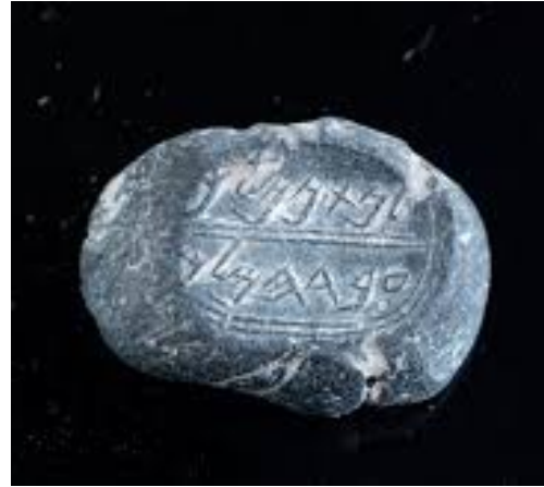
Seal with biblical name found in Jerusalem house destroyed by Babylonians 2,600 years ago -

Since Israel's return to the land at the turn of the 20th century, a slew of artifacts have been unearthed that support the biblical record. The latest, announced this week, is a seal impression (bullae) that reads "Belonging to Nathan-Melech, servant of the king" ("2,600 Year Old Seal Discovered in City of David," Jerusalem Post , Apr. 1, 2019). This name is mentioned in 2 Kings 23:11 in connection with King Josiah's revival. "And he took away the horses that the kings of Judah had given to the sun, at the entering in of the house of the LORD, by the chamber of Nathanmelech the chamberlain, which was in the suburbs, and burned the chariots of the sun with fire." We aren't told specifically that Nathanmelech was complicit with the worship of the sun, but it seems probable since he apparently had allowed this idolatry to be carried out by his own chamber. The Greeks and Romans worshipped the sun god Helios, whose chariot was supposedly drawn by four horses. This image has been found on the mosaic floors of two ancient synagogues in Israel (Tiberias and Zippori). "Jarchi says, that those who adored the sun