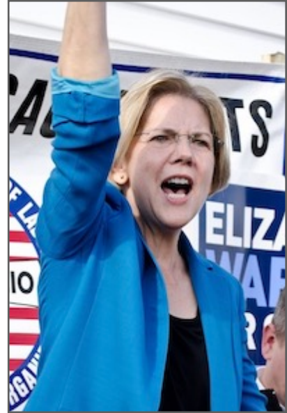
Elizabeth Warren (D-MA)

The following is excerpted from “Warren Confronted over Infanticide Position,” DailyWire.com, Mar. 1, 2019: “Presidential hopeful Senator Elizabeth Warren (D-MA) was confronted over her infanticide position during an event in Dubuque, Iowa, on Wednesday. On Monday, the prominent Democrat went on record as pro-infanticide by voting against Republican Senator Ben Sasse’s Born-Alive Abortion Survivors Protection Act, which would mandate that doctors perform medical care on infants born alive due to botched abortions. Only three Senate Democrats voted for the legislation. After Warren waxed poetic to an Iowa crowd about the importance of healthcare for all, a man attending the event bluntly asked her why infants born alive from botched abortions were denied healthcare. ‘What about the babies that survive abortion?’ he asked. ‘How come they can’t have healthcare?’ Warren responded, ‘Infanticide is illegal everywhere in America.’ ‘You voted against it,’ the man pushed back, referring to her no vote on the Born-Alive Abortion Survivors Protection Act.”