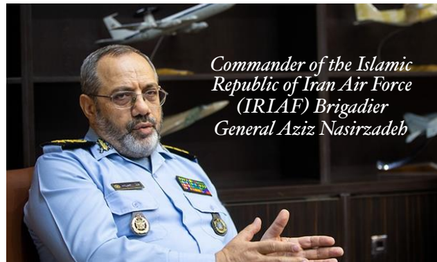
Commander of the Islamic Republic of Iran Air Force (IRIAF) Brigadier General Aziz Nasirzadeh

Israel , May 22, 2016). In March 2016, Iran tested ballistic missiles emblazoned with the words "Israel must be wiped off the map." Last year, Iranian Supreme Leader Ali Khamenei tweeted that Israel "will not see the next 25 years." This is delusional, for the Bible says that Israel cannot be destroyed and that land is her God-given land. Her judgments at God's hand during the "times of the Gentiles" as prophesied in Deuteronomy 28 will be completed during the reign of the Antichrist, the conversion prophesied in Deuteronomy 30:6 will occur, and a truly spiritual Israel will be at the heart of Christ's kingdom. Israel is back in the land, and this is an exciting thing for Bible believers, but she is far from "circumcised in heart" at this time.