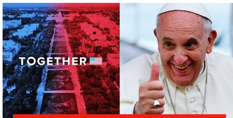
Pope Francis Together 2016