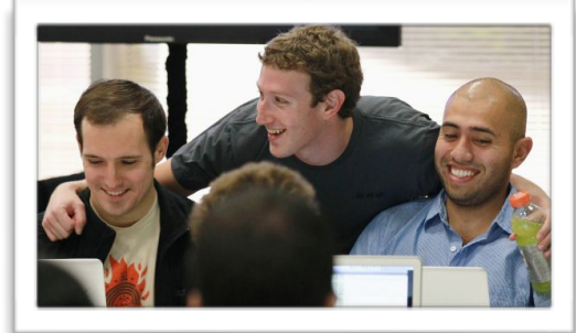
Facebook founder and CEO Mark Zuckerberg with Facebook employees.