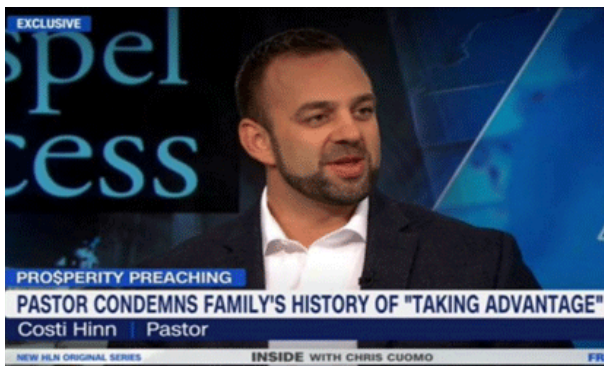
Benny Hinn Is My Uncle, but Prosperity Preaching Isn't for Me- Costi Hinn

The following is excerpted from “Benny Hinn Is My Uncle,” Christianity Today , Nov. 20, 2017: “Growing up in the Hinn family empire was like belonging to some hybrid of the royal family and the mafia. Our lifestyle was lavish, our loyalty was enforced, and our version of the gospel was big business. Though Jesus Christ was still a part of our gospel, he was more of a magic genie than the King of Kings. Rubbing him the right way—by giving money and having enough faith—would unlock your spiritual inheritance. God’s goal was not his glory but our gain. His grace was not to set us free from sin but to make us rich. The abundant life he offered wasn’t eternal, it was now. We