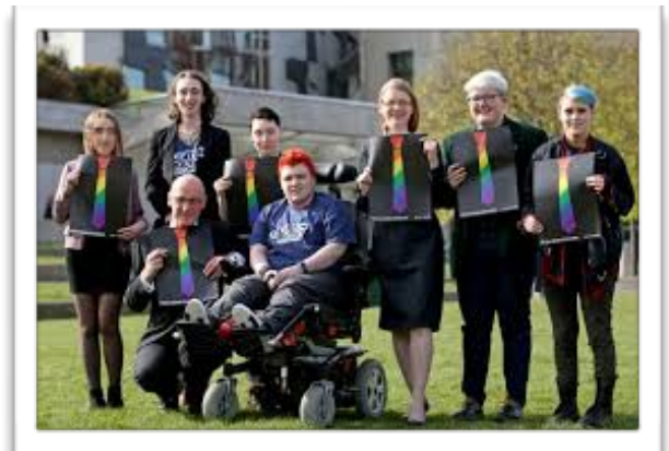
'World first' as Scottish schools to adopt LGBTI inclusive education

The following is excerpted from "Scotland to Embed LGBTI," The Guardian , Nov. 9, 2018: "Scotland will become the first country in the world to embed the teaching of lesbian, gay, bisexual, transgender and intersex rights in the school curriculum, in what campaigners have described as a historic moment. State schools will be required to teach pupils about the history of LGBTI equalities and movements, as well as tackling homophobia and transphobia and exploring LGBTI identity, after ministers accepted in full the recommendations of a working group led by the Time for Inclusive Education (TIE) campaign. There will be no exemptions or opt-outs to the policy, which will embed LGBTI inclusive education across the curriculum and across subjects and which the Scottish government believes is a world first. ... Scotland has regularly been ranked as one of the best countries in Europe in relation to legal protections for LGBTI people ... In 2016, the former Scottish Labour leader Kezia Dugdale described the country as having 'the gayest parliament in the world': at the time four of Scotland's six party leaders (Dugdale, the Conservatives' Ruth Davidson, Ukip's David Coburn and the Greens' Patrick Harvie) identified as lesbian, gay or bisexual."