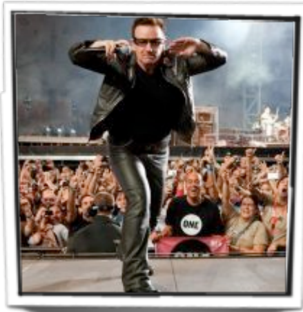
Bono from U2