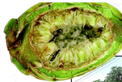
Open fig with its pollinator wasp

that these two complex living things "evolved" at exactly the same time with full-blown capabilities. That sounds more like creation to me! The idea of "co-evolution" is an evolutionary "Just So" story that attempts to explain away the complexity of creation, but it is a fairy tale. Evolutionists have never proposed a creative mechanism that could produce complex living creatures. Natural selection is not creative but genetically selective, and mutations are overwhelmingly destructive and do not build up information to the creature's genome in a creative way.