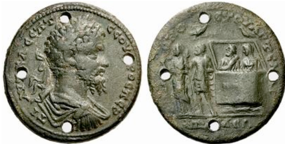
Septimius Severus 193-211 A.D. Æ 34mm 22.99g Noah and wife in arc (right); Noah and wife on dry land post-flood with dove above (left)

During the reign of Roman Emperor Septimius Severus (AD 193-211), a coin was minted in Apamea, Phrygia, to commemorate the Bible's story of Noah's ark. One side of the coin features the image of the emperor. The other side has the images of Noah and his wife inside a box signifying the ark floating on waves. Noah and his