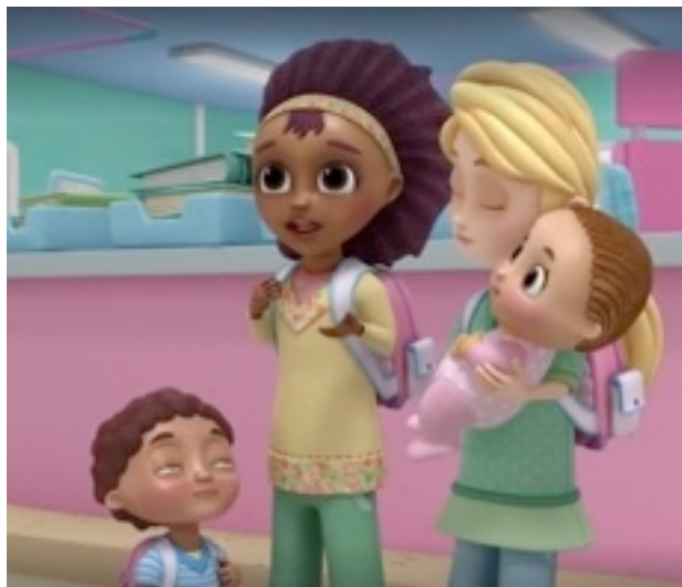
“Doc McStuffins - Emergency Plan”