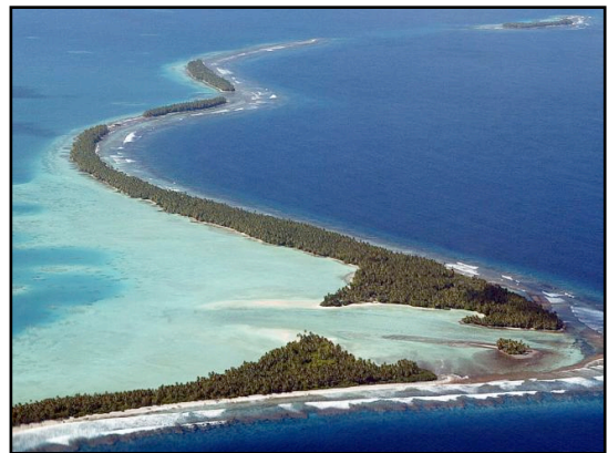
The island nation of Tuvalu is made up of three true islands and six coral atolls

Since the 1990s, global warming alarmists have been saying that the Tuvalu Islands in the South Pacific will be inundated by a rising ocean. The islands stand only a few feet above sea level. A 1996 climate change study warned that "Tuvalu is particularly susceptible to the adverse impacts of climate change and in particular rising sea level." Believing the hype and convinced that they will drown because of "excessive carbon dioxide emissions" in other parts of the world, the residents of Tuvalu threatened to sue the U.S. and Australia. In 2003, Tuvalu's Prime Minister told the United Nations that global-warming is "a slow and insidious form of terrorism against us" ("Will Tuvalu Disappear Beneath the Sea?" Smithsonian Magazine , Aug. 2004). The latest research finds, though, that the islands are growing in size. Since 1970, they have added 181 acres of new land. Paul Kench, a co-author of the new study at the University of Auckland, says, "We tend to think of Pacific atolls as static landforms that will simply be inundated as sea levels rise but there is growing evidence these islands are geologically dynamic and are constantly changing" ("Tuvalu Is Growing," UPI, Feb. 9, 2018).