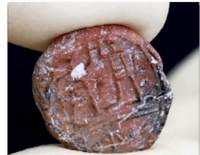
2,700-year-old governor's seal that scholars say corroborates part of Biblical history and supports Jerusalem as Israel's capital.

The following is excerpted from “2,700-year-old seal impression,” The Times of Israel , Jan. 1, 2018: “Past and present collided last week when an extremely rare seal impression discovered in Jerusalem’s Western Wall plaza and bearing the inscription ‘To the governor of the city’ was presented to Jerusalem Mayor Nir Barkat. According to site excavator Dr. Shlomit Weksler-Bdolah, ‘This is the first time that such an impression was found in an authorized excavation. It supports the biblical rendering of the existence of a governor of the city in Jerusalem 2,700 years ago.’ At the presentation, Barkat said, ‘This shows that already 2,700 years ago, Jerusalem, the capital of Israel, was a strong and central city.’ The minuscule clay seal impression, or docket, was found while researchers were examining the dust from a First Temple structure 100 meters northwest of the Western Wall at a site the Israel Antiquity Authorities has been excavating since 2005. ... The small (13 x 15 mm and 2–3 mm thick) fired lump of clay bears an image and inscription. On the upper portion of the impression, two figures wearing striped garments face each other. ... Weksler-Bdolah explains that the governor most likely functioned much like today’s mayor. The role is referenced in the Hebrew Bible: in 2 Kings 23:8, Joshua is listed as the governor of the city in the days of Hezekiah, and in 2 Chronicles 34:8, Maaseiah is noted as governor of the city in the days of Josiah.”