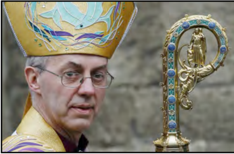
Archbishop of Canterbury Justin Welby

There are many calls these days for ecumenical revival prayer. The latest is an initiative of the Archbishop of Canterbury geared for the spring of 2017. “Catholics, Baptists, Pentecostals, Copts, Methodists, Orthodox Christians and members of free churches will unite under the Anglican umbrella after the presidents of Churches Together in England (CTE) announced on Monday they would accept the invitation to pray in the 10 days before Pentecost 2017. ... They will write to their churches--which range from Seventh-Day Adventists churches to Coptic Orthodox churches--and encourage them to participate. ‘We pray to the Father that his family, called to be one in